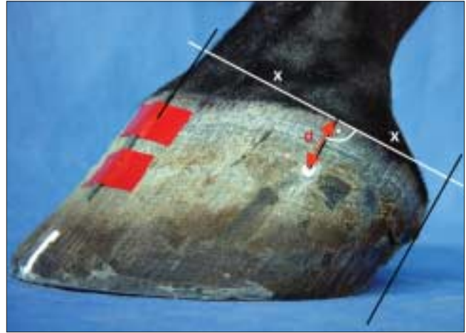
Figure 2. Main beam of the X-Ray generator is positioned 2 cm (d) below the coronary band and at a right angle to the middle of the line between the bulbs of the heel and the dorsal aspect of the hoof wall.

The aim of this study was to determine the exactness of the various parameters of the equine hoof obtained with the Metron-PX software.