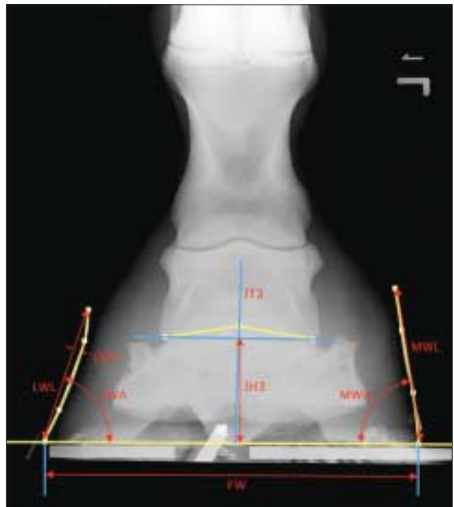
Figure 7. Joint and hoof parameters of a dorsopalmar radiograph. LWL: Lateral wall length, from the hairline to the lateral distal hoof rim. LWA: Angle between the lateral wall and the ground. LWD: Lateral wall deviation, longest perpendicular distance from the LWL to the contour of the lateral hoof wall. MWL: Medial wall length, from the hairline to the medial distal hoof rim. MWA: Angle between the medial wall and the ground. MWD: Medial wall deviation, longest perpendicular distance from the MWL to the contour of the medial hoof wall (not measurable in this radiograph). FW: Foot width, distance between medial and lateral hoof rim. JH3: P2-P3 Joint Height, vertical distance between the ground and the blue line connecting the most medial and most lateral aspect of the P2-P3 joint. JT3: P2-P3 Joint Tilt, Angle between the perpendicular line to the ground and the perpendicular line to horizontal blue line connecting the most medial and most lateral aspect of the P2-P3 joint.

From the digital bone parameters, the variable that showed the least variation was the radius of the distal interphalangeal articulation (JR3). The parameter founder distance was significantly smaller on the anatomic sec-