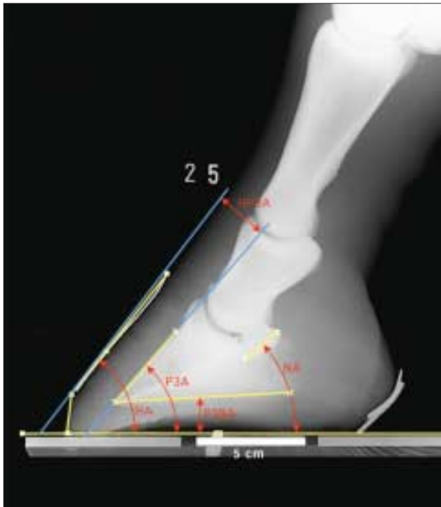
Figure 5. Angle measurements of the laterolateral radiograph. P3A: P3 angle, from the dorsal midline of P3 to the ground plane. NA: Navicular Angle, the angle between the axis of the navicular bone and the ground. HA: Hoof Angle, the angle between the dorsal hoof wall and the ground, as it would be read from a physical “hoof gauge.” HP3A: hoof-P3 angle, the angle of the lines formed by the dorsal hoof wall and the dorsal wall of P3. P3BA: P3 bottom angle, the angle formed between the bottom (palmar surface) of P3 and the ground.