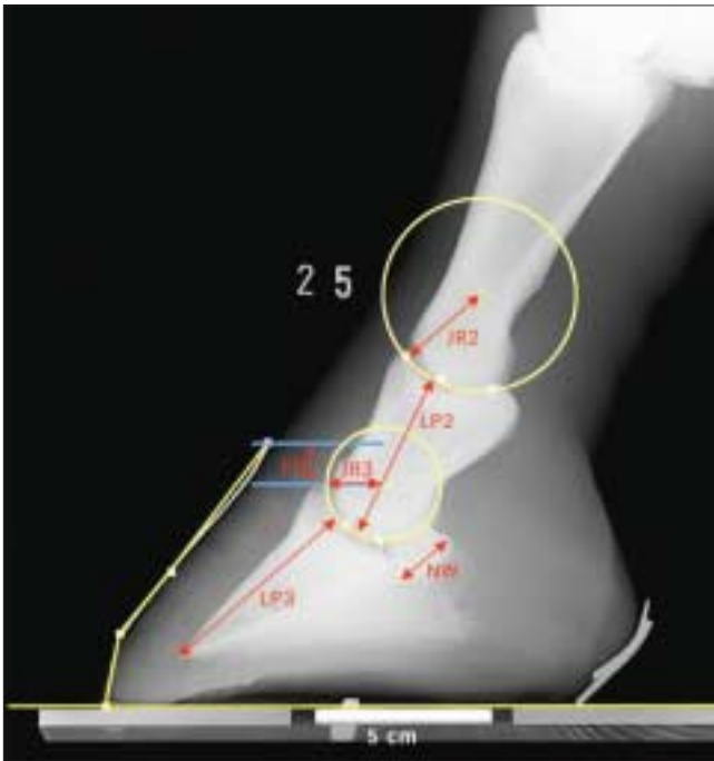
Figure 3. Bone parameters of the laterolateral radiograph. JR2: P1-P2 joint radius, distance from the centre of rotation to the articular surface. JR3: P2-P3 joint radius, distance from the centre of rotation to the articular surface. LP2: Length of P2, the distance between the two rotation centres of the distal interphalangeal joints minus P1-P2 joint radius (JR2) and plus P2-P3 joint radius (JR3). LP3: Length of P3, from the tip of P3 to the centre of rotation of the distal interphalangeal joint minus P2-P3 joint radius (JR3) NW: Navicular bone width, the width of the navicular bone (maximum width as seen on this view). FD: Founder Distance is the P3 descent. Distance between two horizontal lines through the hairline and the top of extensor process of P3, respectively. It is a measure of the height of P3 in the hoof capsule.