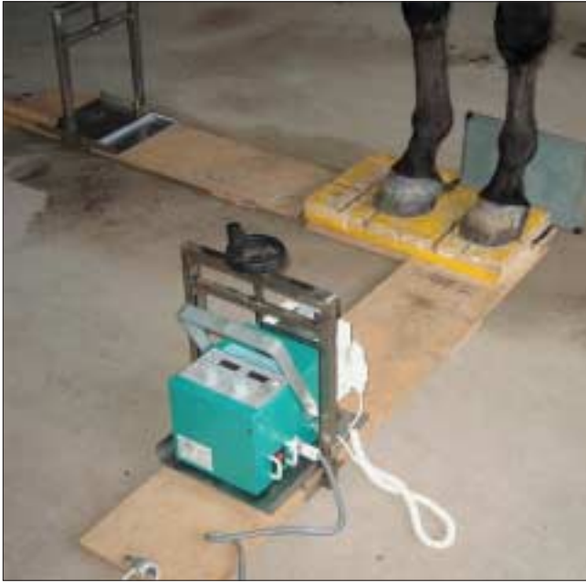
Figure 1. All radiographs were taken with the limbs positioned on a special platform, which allows taking dorsopalmar radiographs at the same level as the lateromedial.

tic radiographs are to be produced. Preparation of the foot, positioning of the hoof, and radiographic techniques have been described by other authors, 3-8 and the normal radiographic anatomy of the digit is illustrated elsewhere. 3,9-11