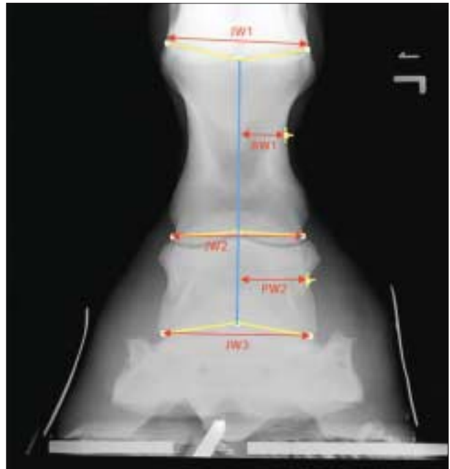
Figure 6. Bone parameters of a dorsopalmar radiograph. JW1: Metacarpal—P1 joint width. JW2: P1-P2 Joint width. JW3: P2-P3 joint width. The width of the joint is the distance between the most medial and lateral aspects of each joint. BW1: P1 Bone Width. BW2: P2 Bone width. The width of the P1 and P2 bones is the value for the distance from the “axis” of the bone (blue line) to the narrowest part of the bone as seen from this view.

In a second step, repeated measurements of all parameters that are included in the Metron-PX program for the dorsopalmar and the lateromedial radiographs (Figs 3-7) were carried out to investigate the effect of the same operator (A), different operators (B), and the radiographic technique (C). Test A was carried out to establish the variability of repeated measurements of the same digital radiograph by 1 operator (VJ). Test B was performed